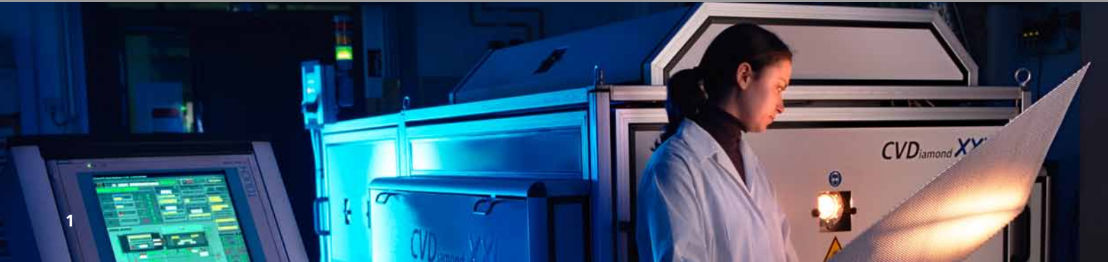
1 Hot-filament CVD installation for the large-area coating (up to 50 cm x 100 cm) of electrodes with conductive diamond